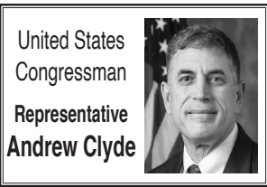
United States Congressman Representative Andrew Clyde

Biden Impeachment Inquiry Begins: Accountability is finally here.